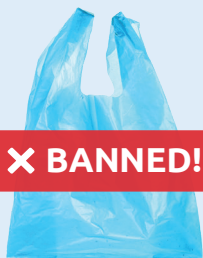
Single-use Carryout Bag