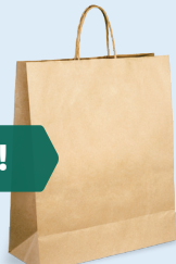
Recyclable Paper Bag for 10¢