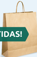
Bolsa de papel reciclable por 10¢